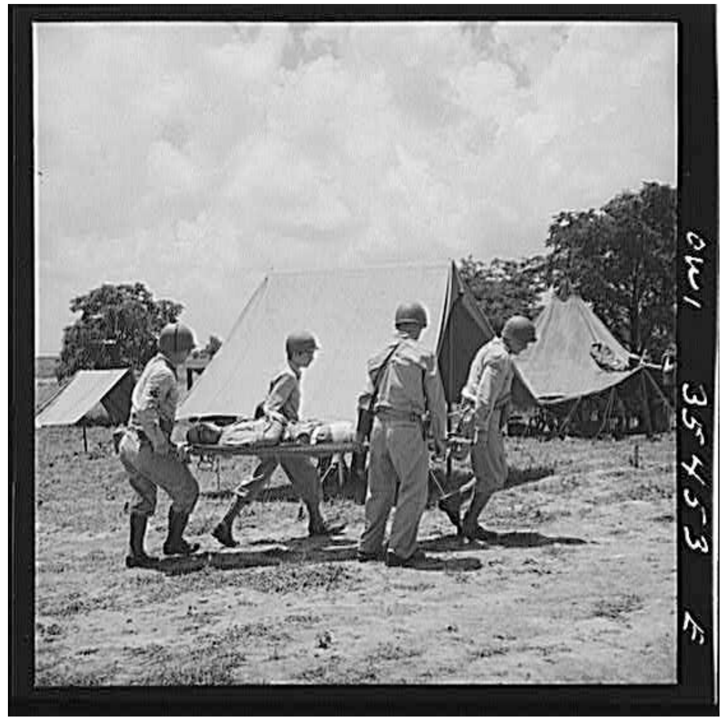
For current digital location and citation information, please refer to the OAV website under Facilitator Resources.