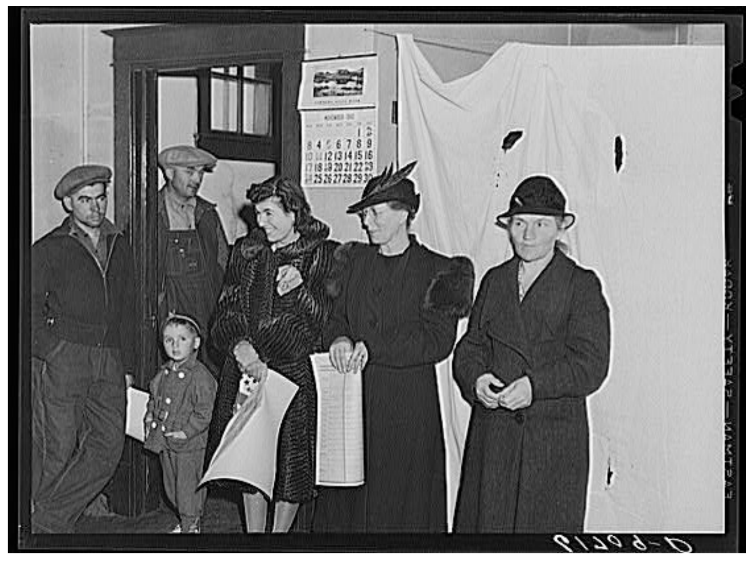
For current digital location and citation information, please refer to the OAV website under Facilitator Resources.