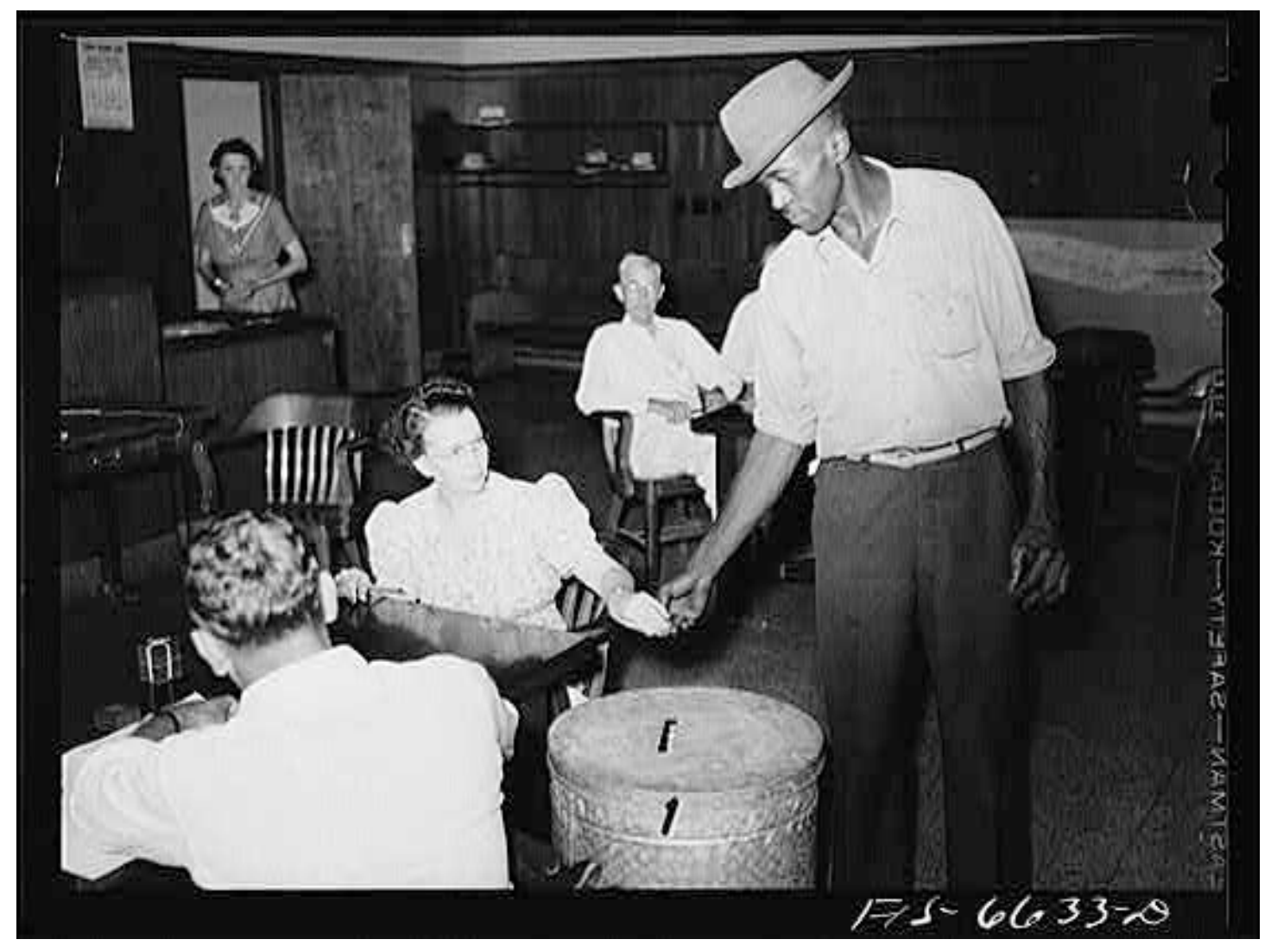
For current digital location and citation information, please refer to the OAV website under Facilitator Resources.