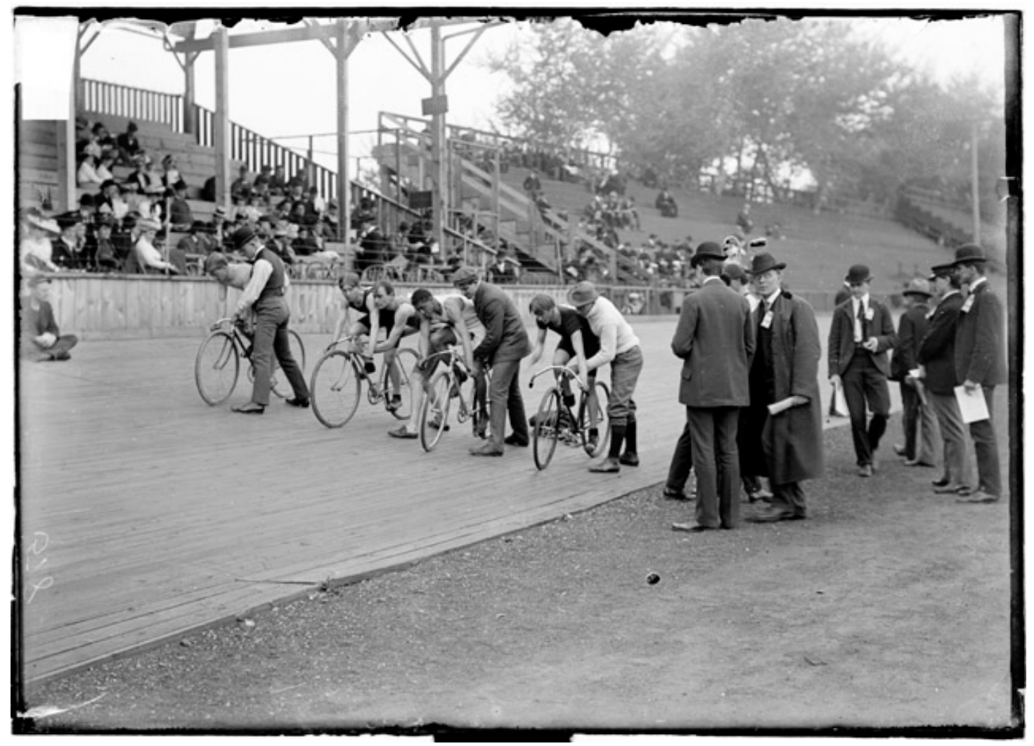
For current digital location and citation information, please refer to the OAV website under Facilitator Resources.