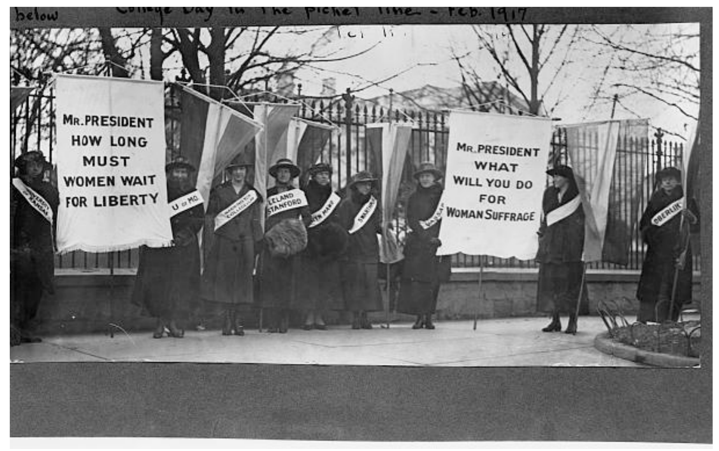
For current digital location and citation information, please refer to the OAV website under Facilitator Resources.