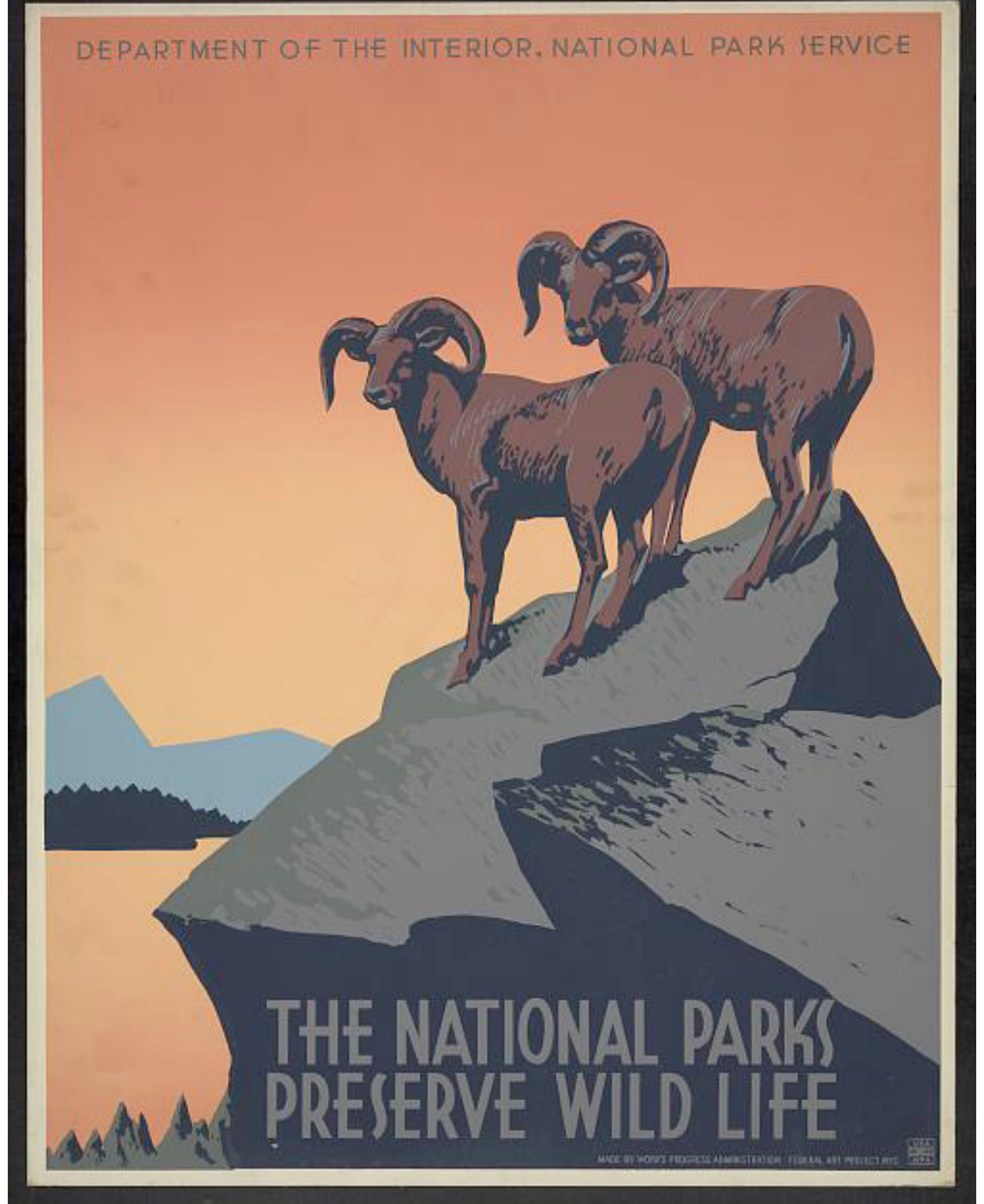
For current digital location and citation information, please refer to the OAV website under Facilitator Resources.