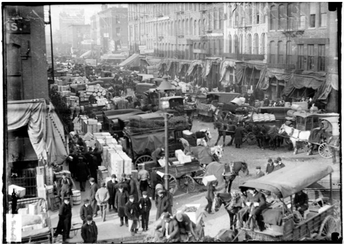
For current digital location and citation information, please refer to the OAV website under Facilitator Resources.