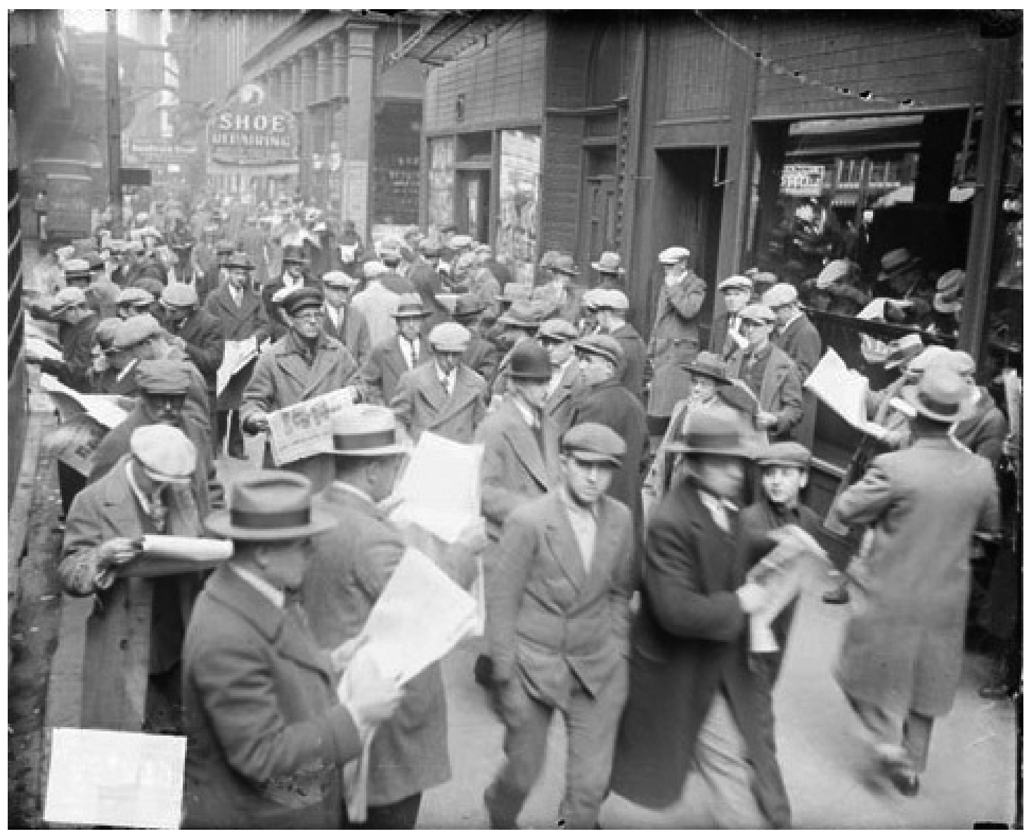
For current digital location and citation information, please refer to the OAV website under Facilitator Resources.