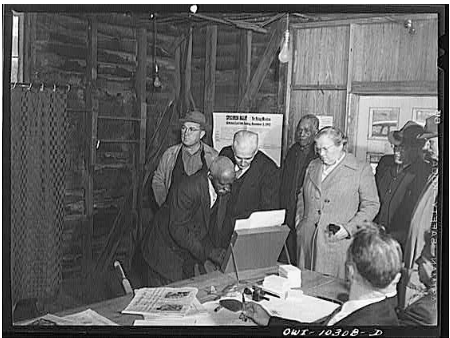
For current digital location and citation information, please refer to the OAV website under Facilitator Resources.