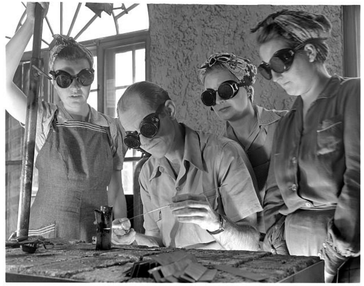
For current digital location and citation information, please refer to the OAV website under Facilitator Resources.