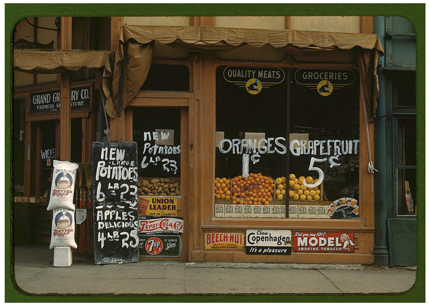
For current digital location and citation information, please refer to the OAV website under Facilitator Resources.