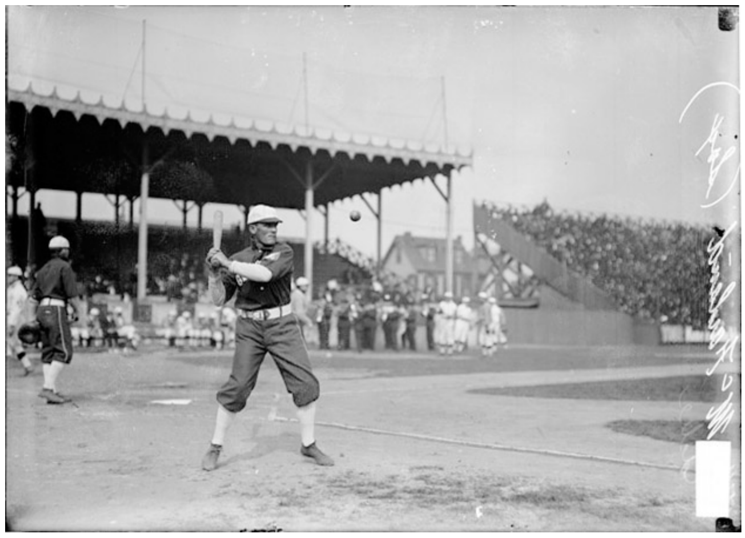
For current digital location and citation information, please refer to the OAV website under Facilitator Resources.