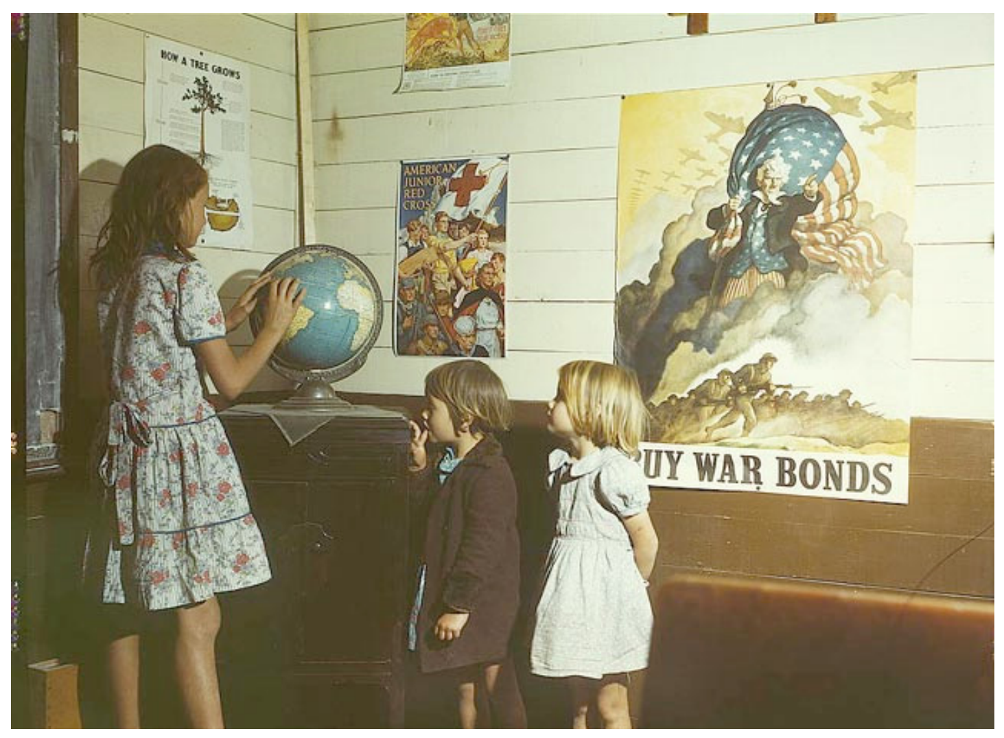
For current digital location and citation information, please refer to the OAV website under Facilitator Resources.