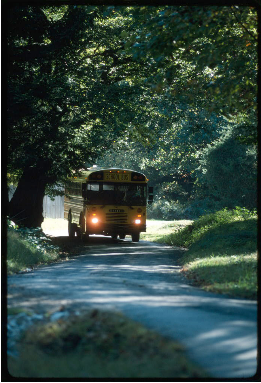
For current digital location and citation information, please refer to the OAV website under Facilitator Resources.