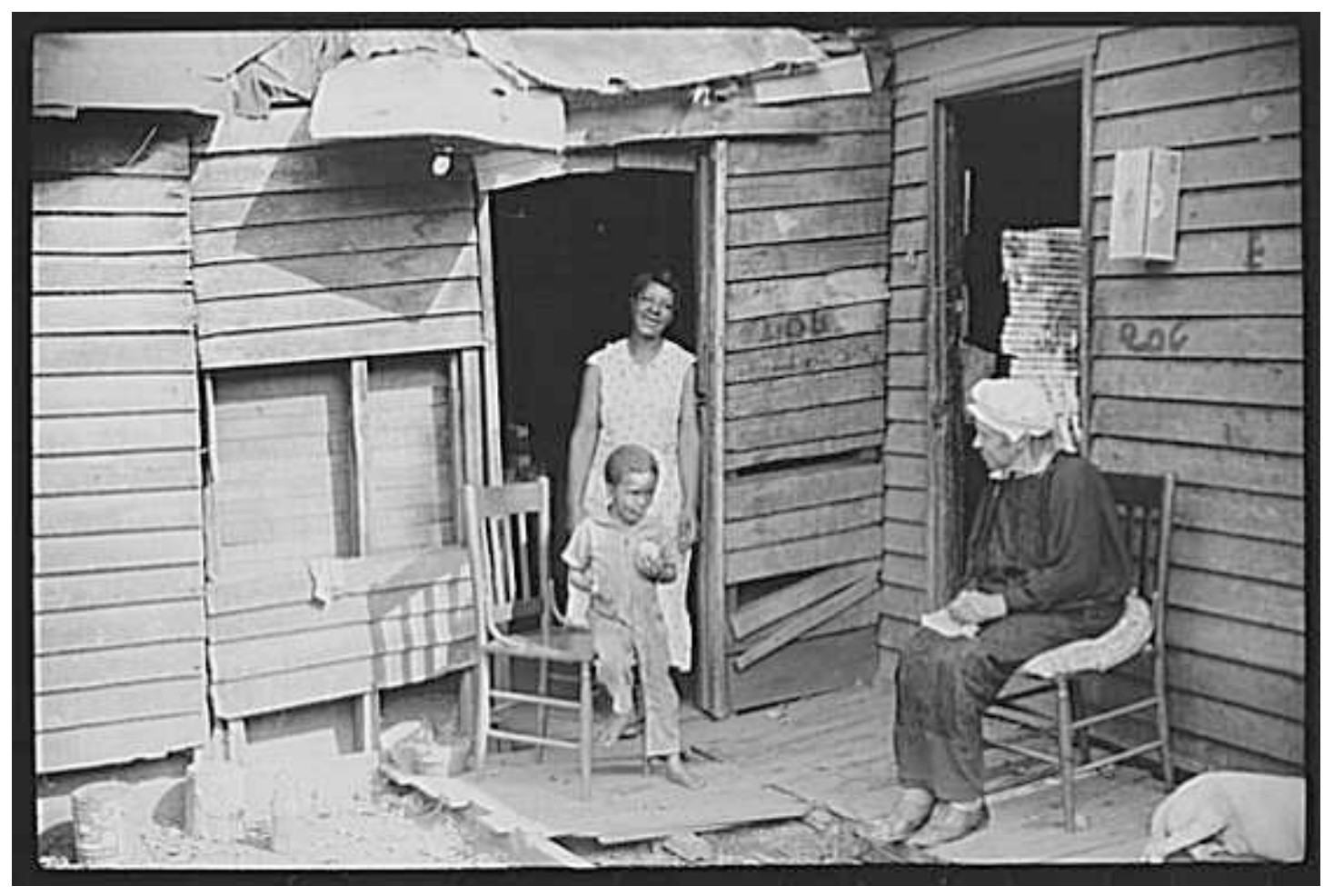
For current digital location and citation information, please refer to the OAV website under Facilitator Resources.