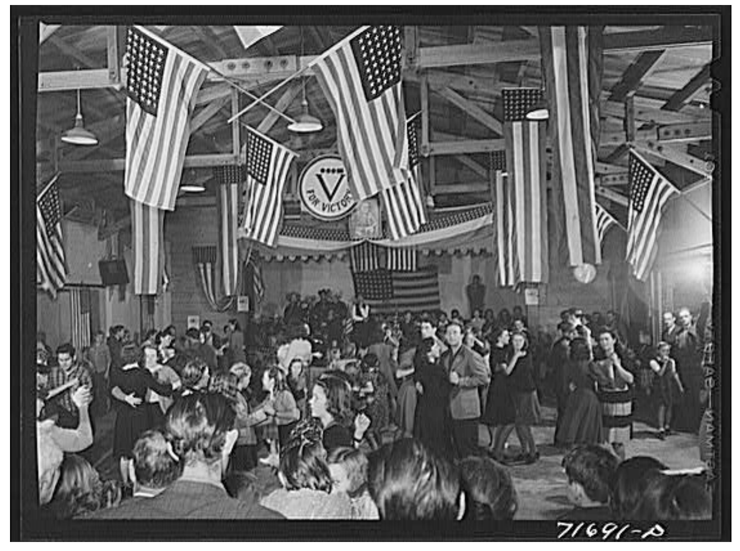
For current digital location and citation information, please refer to the OAV website under Facilitator Resources.