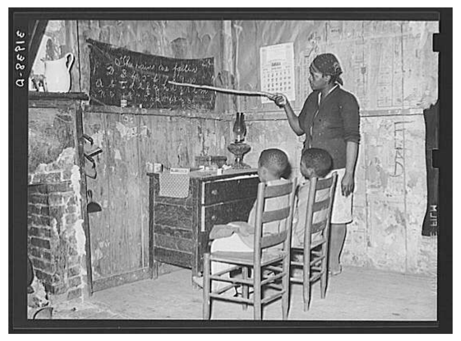
For current digital location and citation information, please refer to the OAV website under Facilitator Resources.