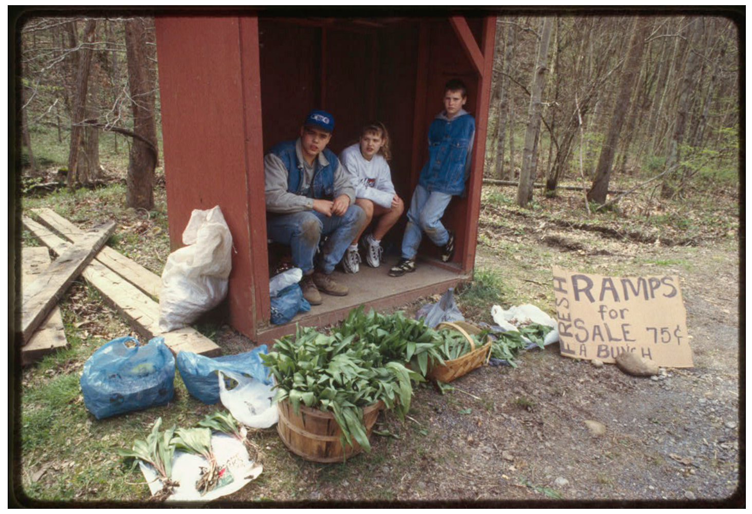
For current digital location and citation information, please refer to the OAV website under Facilitator Resources.